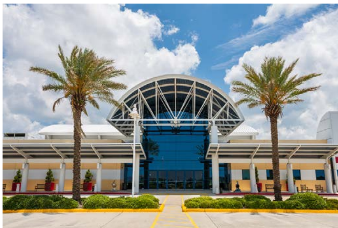
Figure 1. Northshore Harbor Center main entrance

The Northshore Harbor Center facility is pictured in Figure 1, and its location is illustrated in Figure 2.