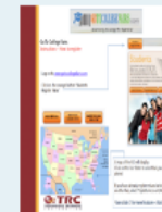
How To Register