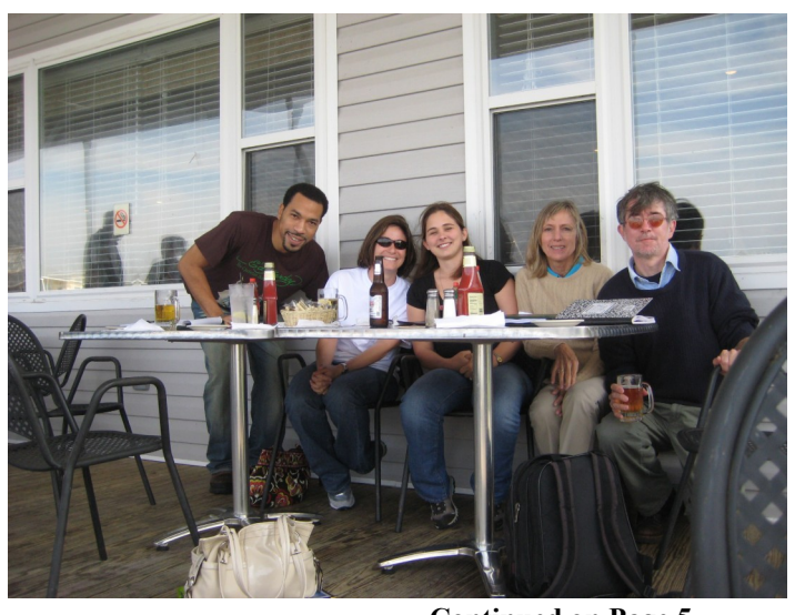
Continued on Page 5

One of our innovations for this series was